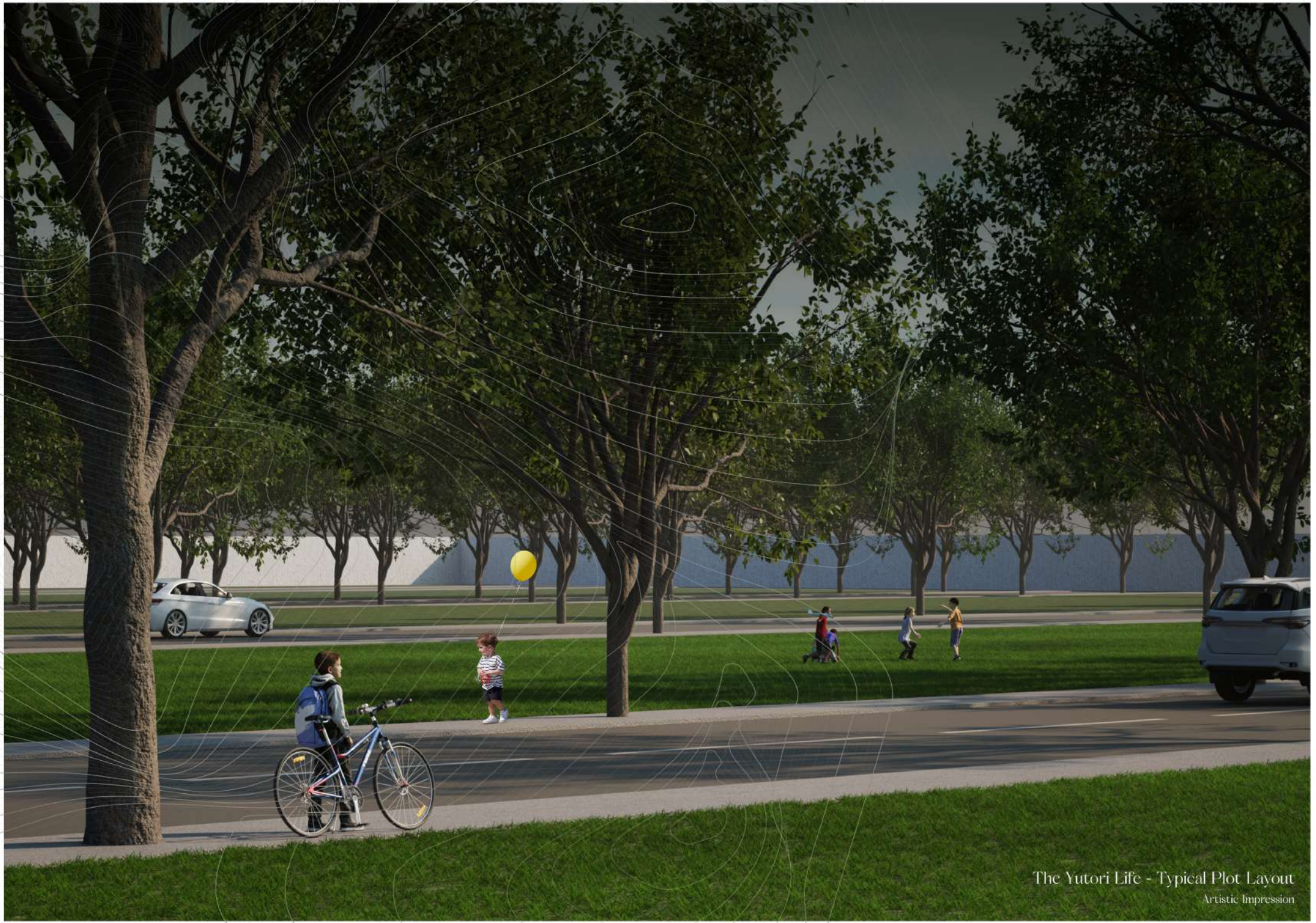
The Yutori Life - Typical Plot Layout Artistic Impression